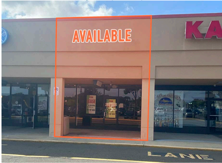
STOREFRONT ±1,680 SF (SPACE 10)