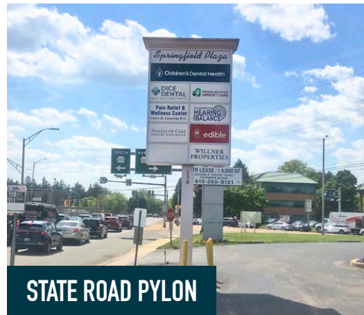
STATE ROAD PYLON