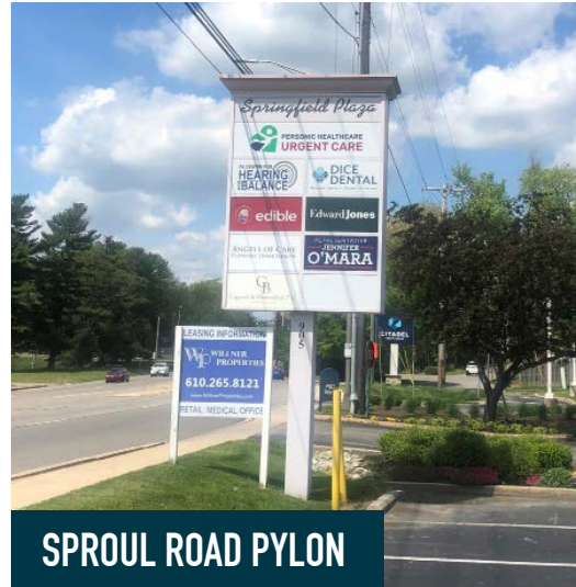
SPROUL ROAD PYLON