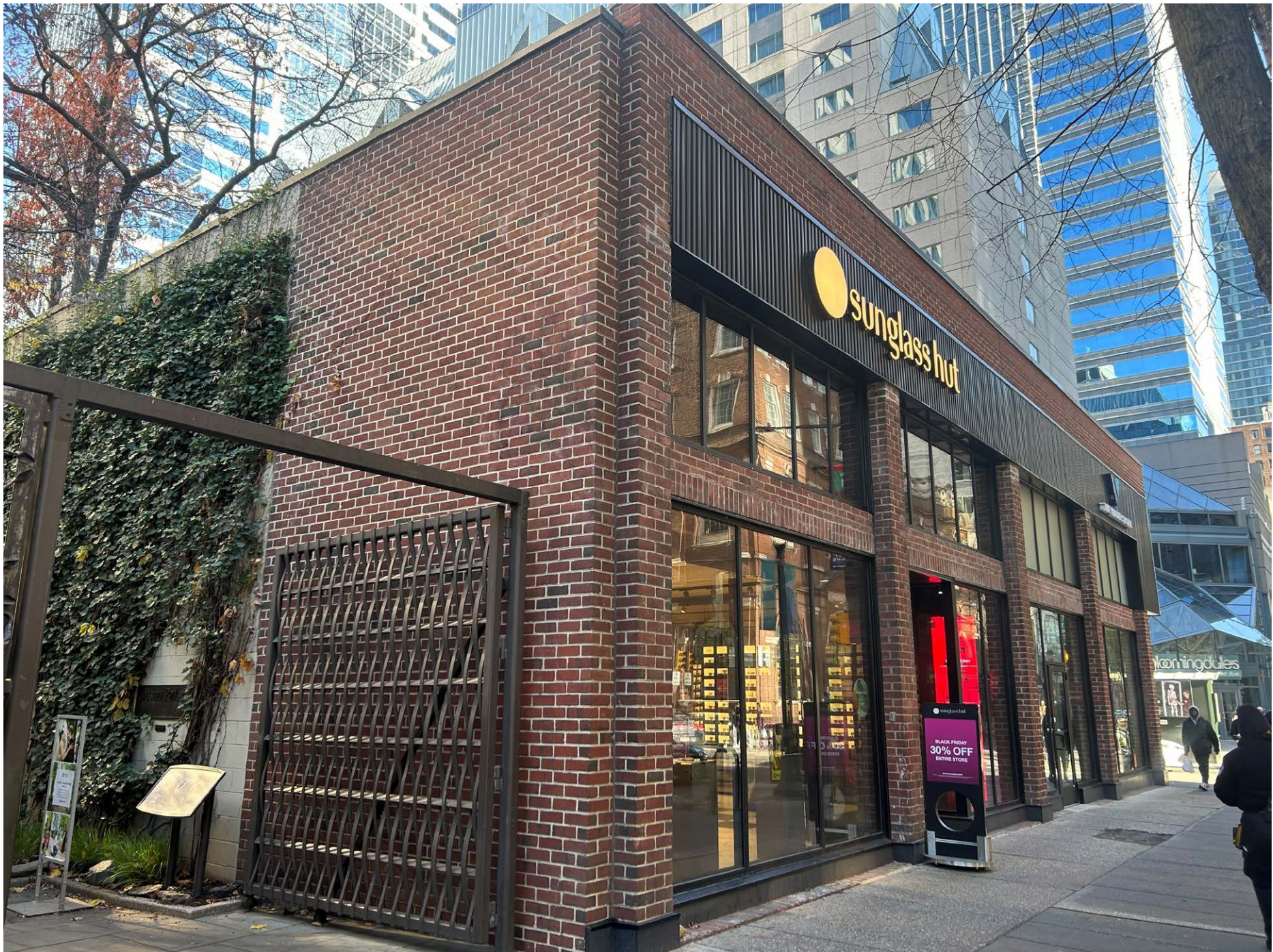
The information and images contained herein are from sources deemed reliable. However, Metro Commercial Real Estate, Inc. makes no representation whatsoever as to their accuracy or authenticity. Images shown may be modified for illustrative purposes. Images may be out-of-date and not current. 12.04.24