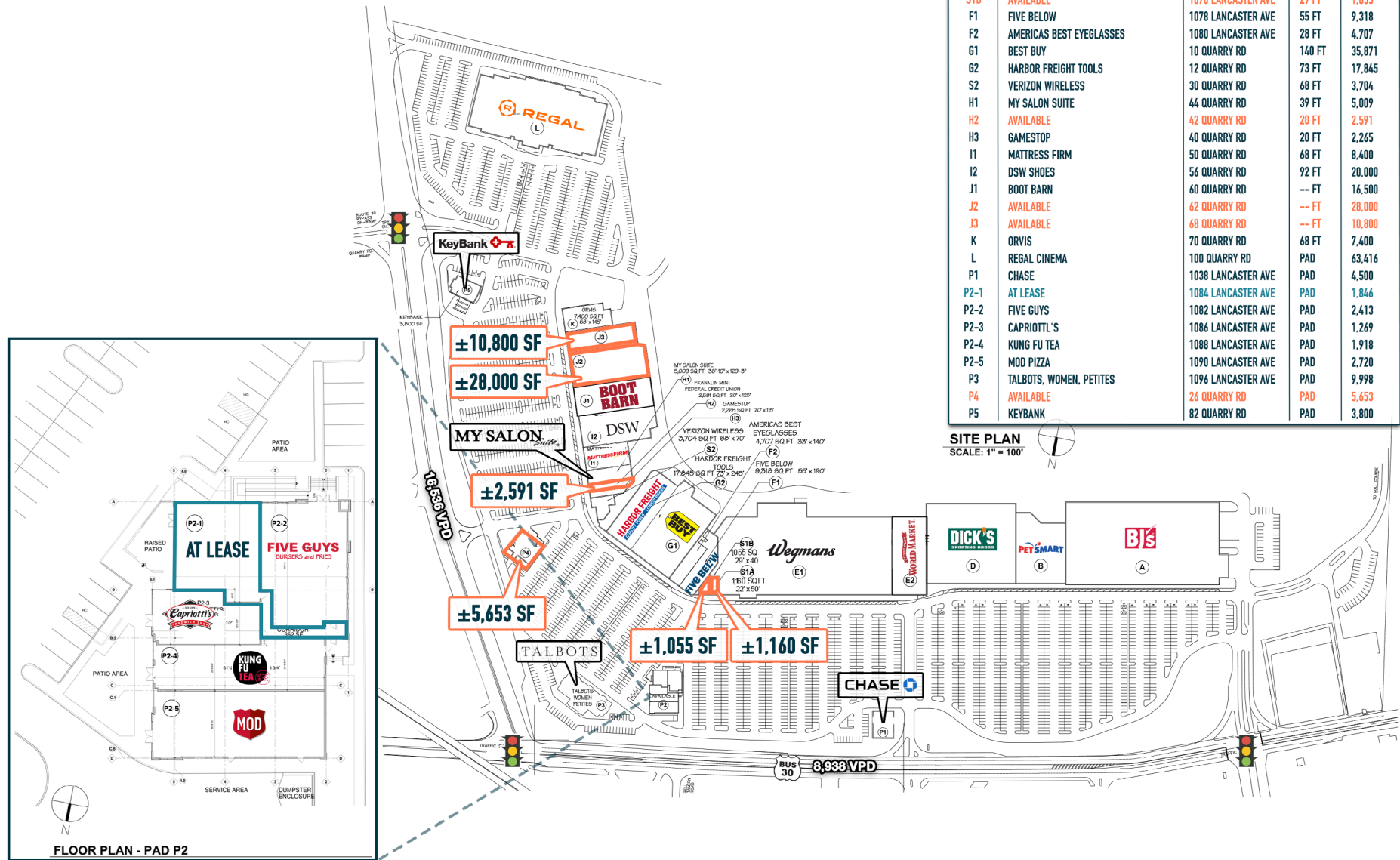
FLOOR PLAN - PAD P2